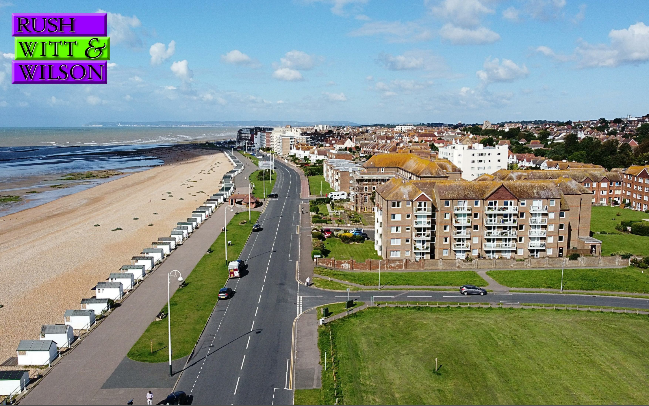
46 Homewarr House De La Warr Parade, Bexhill-On-Sea, East Sussex TN40 1PL £129,950